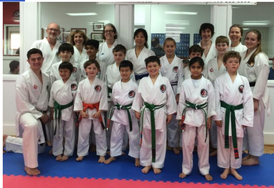
Second Testing Group