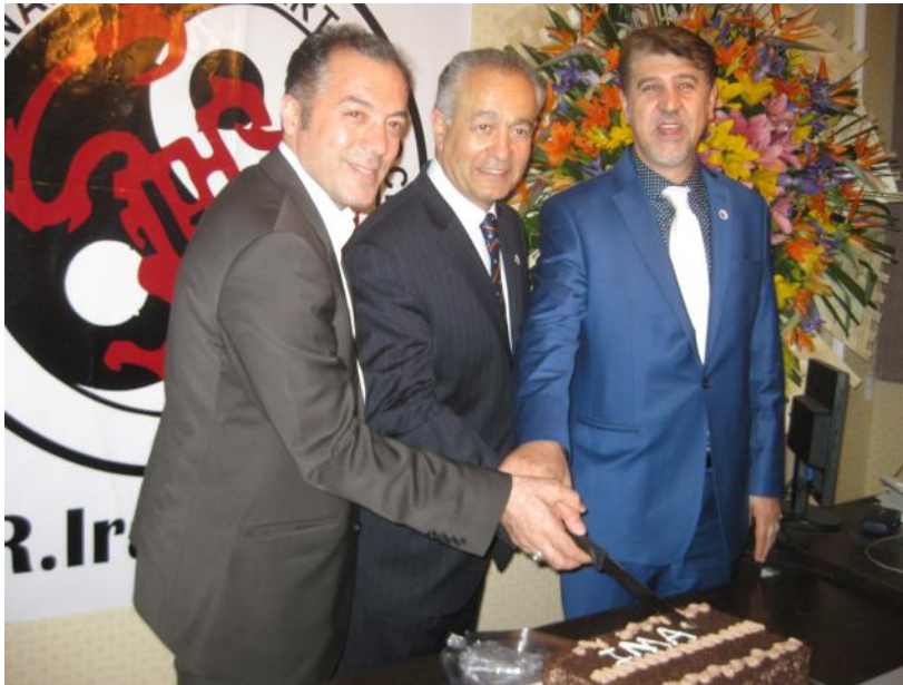
The cutting of the cake for the grand opening of the I.M.A. office in Iran.