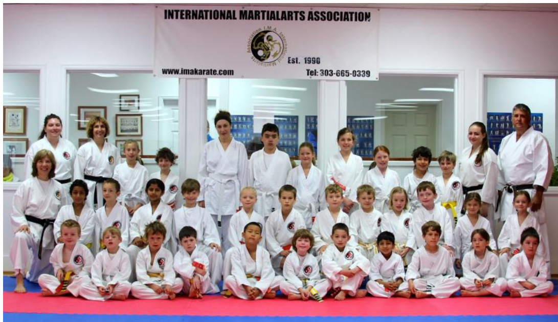
First Testing Group