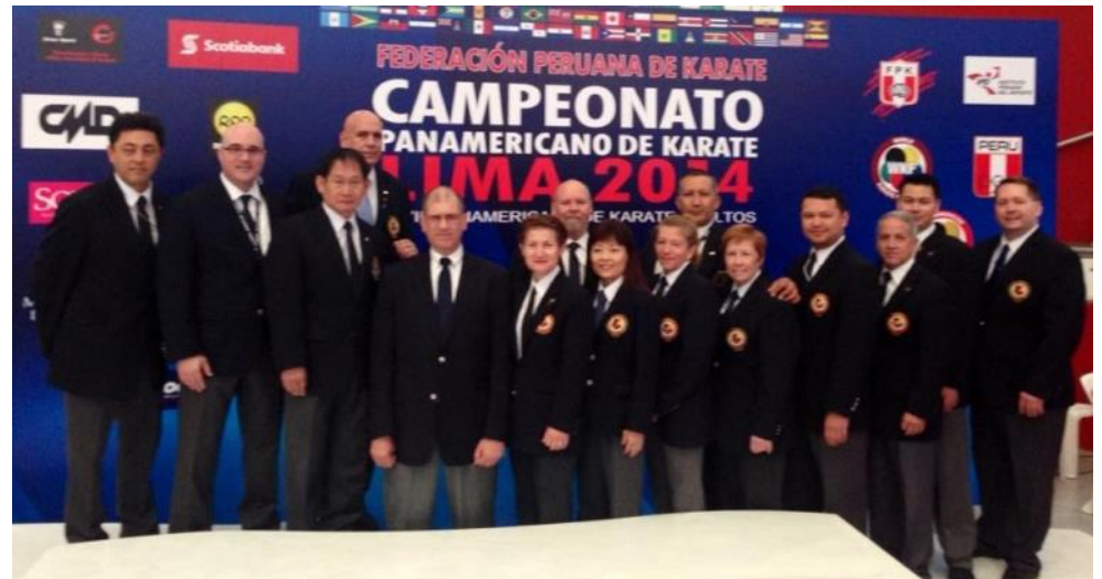
USA Karate Officials at the Senior Pan American Championship in Lima, Peru.

It's time to Parrrrrrrrty! Our Annual IMA Summer Picnic Potluck will be held on Saturday, June 28th, from 3:00 to 7:00 PM, at the Louisville Community Park at 955 Bella Vista Drive. Bring a side dish or dessert to share and come out and join us! We will gather under the large pavilion next to the playground. Kids (and adults) can bring their swimsuits and splash around in the water "sprayground"! Bring the whole family! In addition to the playground and sprayground, this park features a basketball court, a dirt bike hill, bocce courts, horseshoe pits and even a fenced dog park with a pond for your furry family members. Don't miss the fun! We look forward to seeing you there!