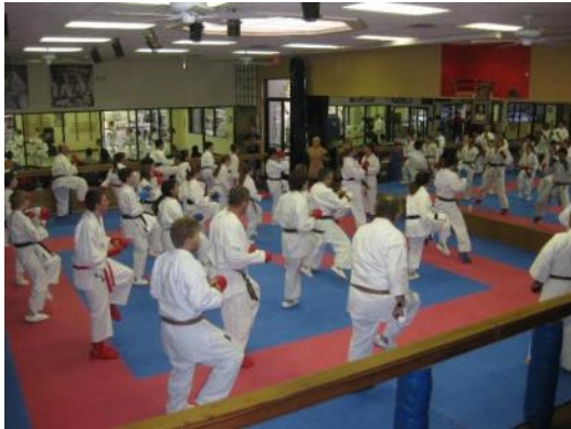
Sensei leading kicking and agility drills