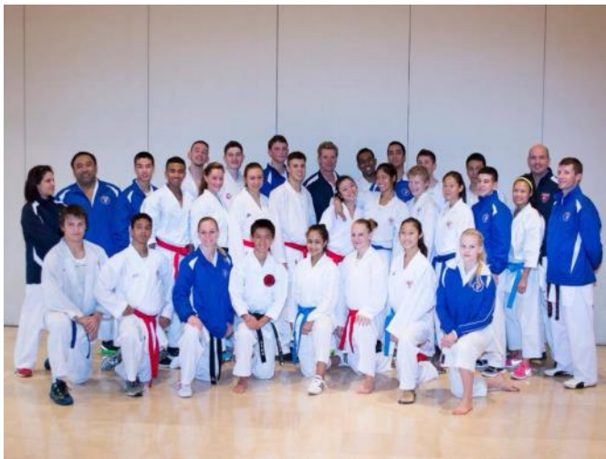
US Team in Guadalajara, Spain